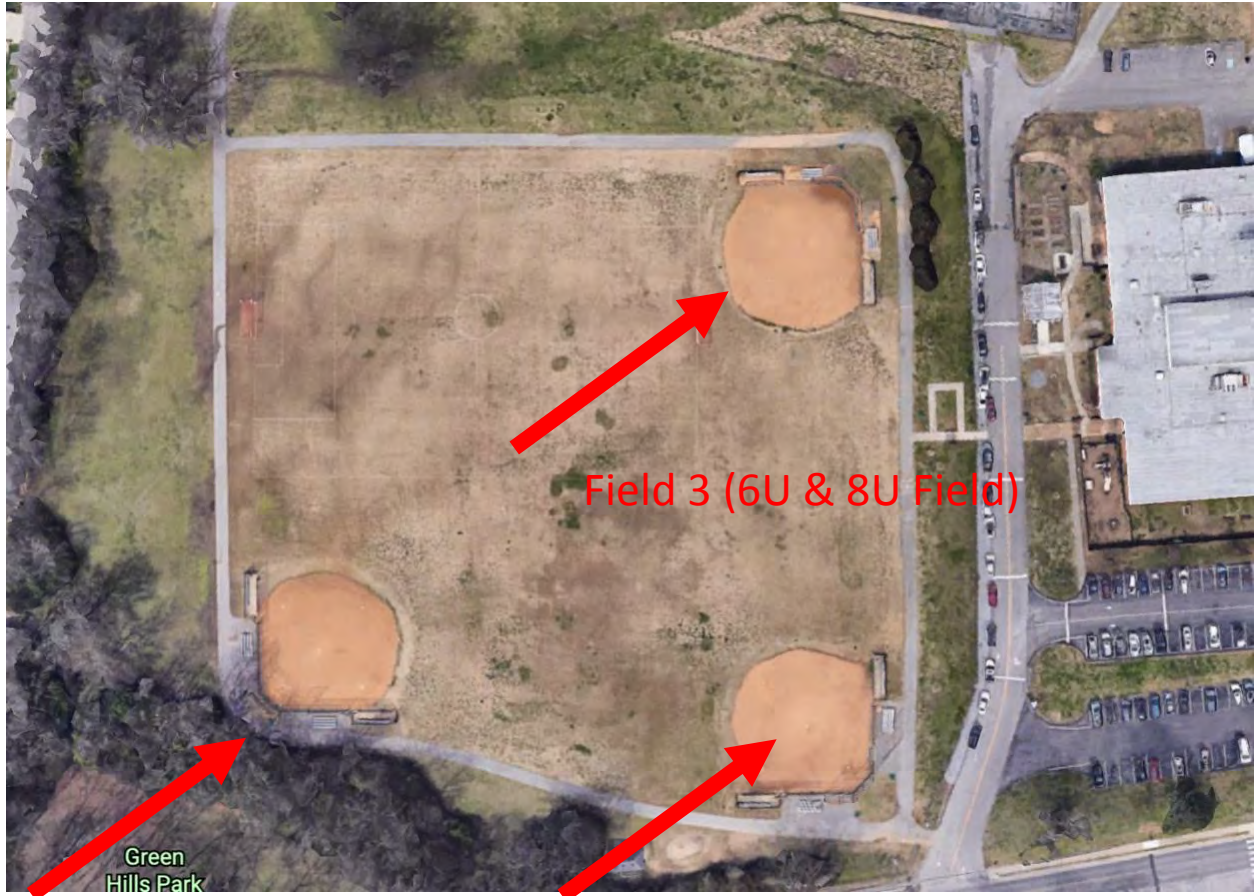
Field 2 (10U Field)